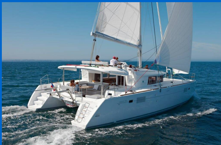
Lagoon 450 - Meritum catamaran

Catamaran Lagoon 450 F Anja, built in 2019 is anchored in the Marina Frapa, Rogoznica, Šibenik region, Croatia. It has 4 + 2 cabins, can accommodate 8 + 2 + 2 people and has 4 toilets. Bed linen and kitchen equipment are included in the price. Bed linen and kitchen equipment are included in the price.